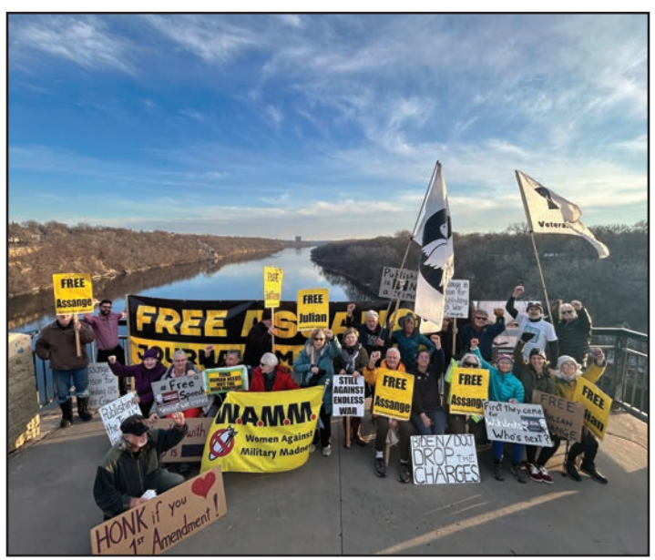
Twin Cities activists showing support for Julian Assange

"The medical, factual and circumstantial evidence at my disposal shows that the manner in which Sweden conducted its preliminary investigation against Mr. Assange, including the unrestrained and unqualified dissemination and perpetuation of the 'rape-suspect' narrative, was the primary factor that triggered, enabled and encouraged the subsequent campaign of sustained and concerted public