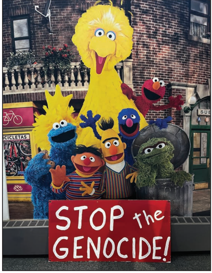
Sign placed by protestor outside Twin Cities Public Television.