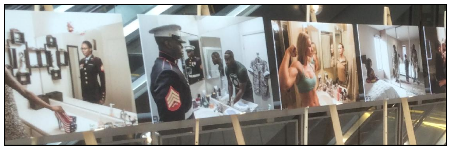
by Ron Staff

Back to the past, I sit in this "Crystal Court," which was my home away from the apartment while unemployed after Vietnam. There is a veteran's "The War Within" exhibit of pictures of veterans in uniform in lavatory situations looking at themselves in a mirror or mirrors with and without their uniforms on. I was taken back by it.