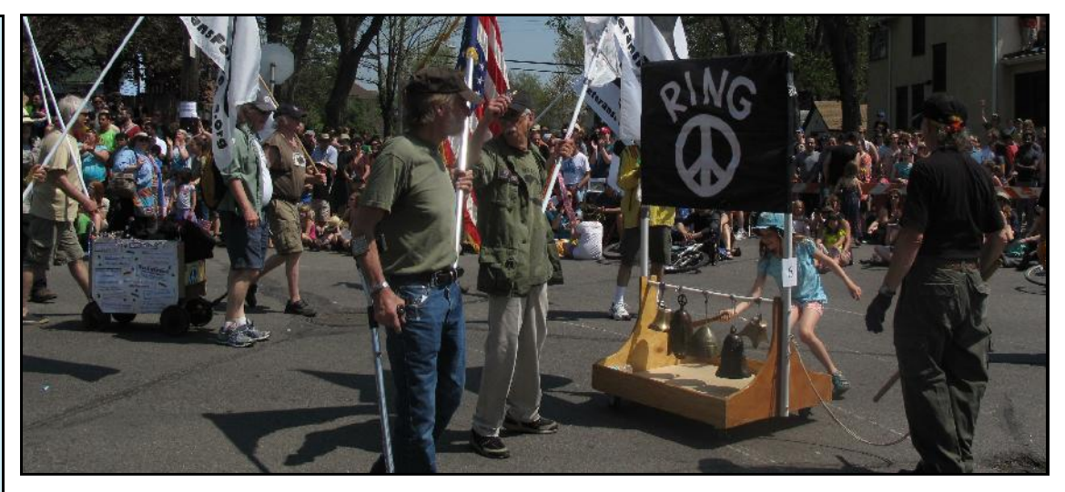
VFP cart with the bells cast by members last year.