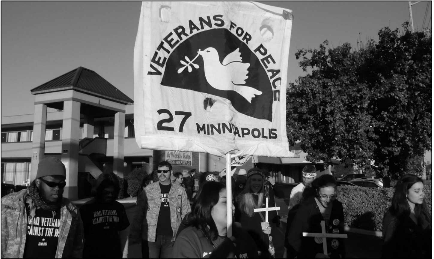
Chapter 27 contingent in the VFP-sponsored march to Ft. Benning.

must be shut down, peace and justice must be restored to Latin America, and we could make a difference.