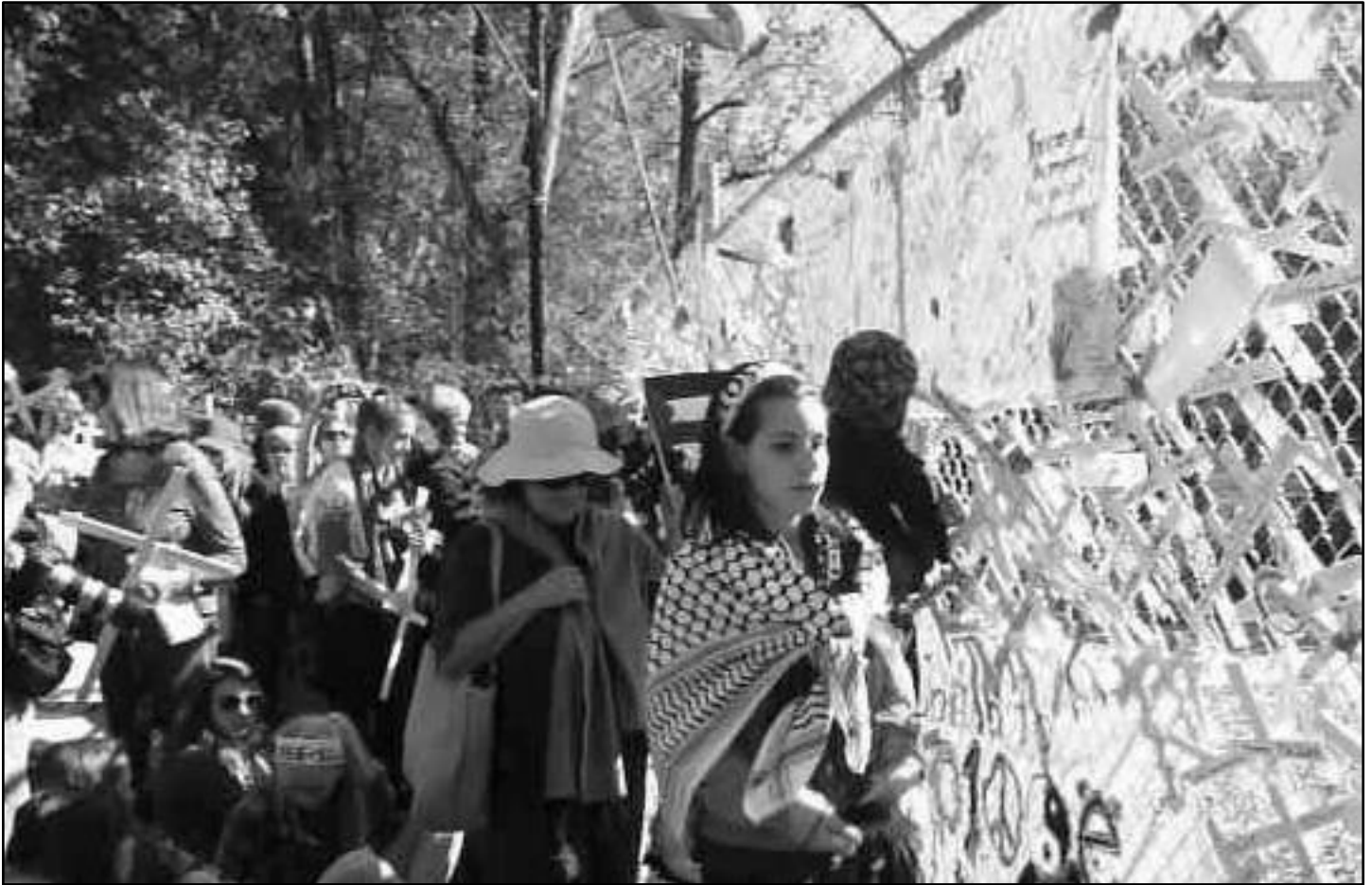
Crosses are placed in the chain-link fence in front of the main gate at Fort Benning.

life-changing experience for all of us. May it also be a life-changing experience for those whose pain and suffering we dare to voice: the victims of SOA/WHINSEC and their families.