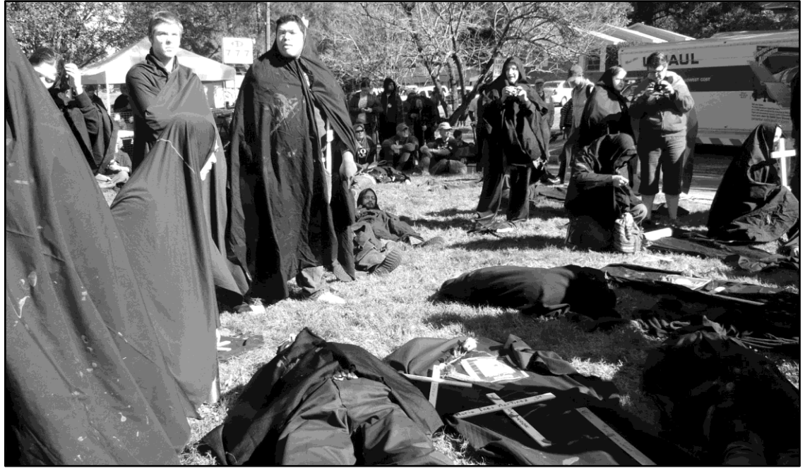
Participants in the die-in at the main gate to Ft. Benning at the SOA protests.