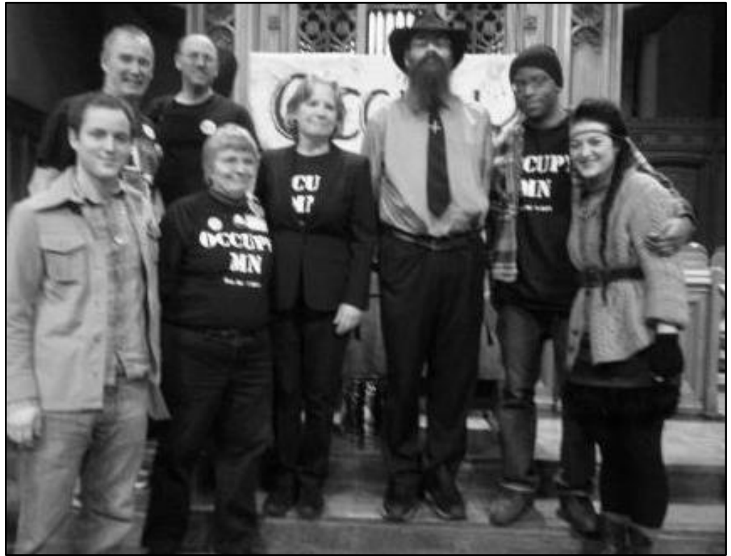
Members of Occupy Minneapolis, Occupy Homes and Whealthy Human Village were featured at the Nov. 13 Minnesota Alliance for Peacemakers meeting and spoke about their actions described in this article.

Overall, despite the constant police harassment, surveil-