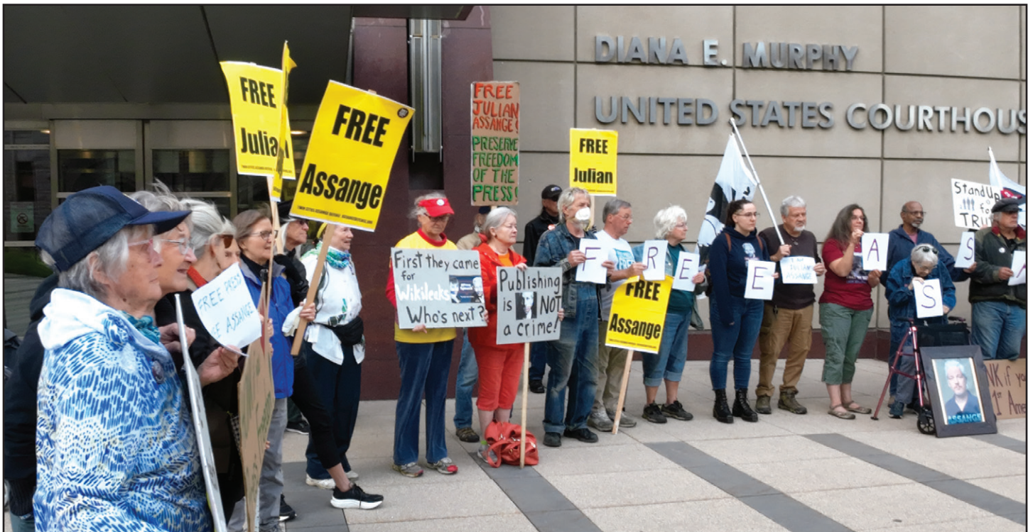
Twin Cities activists downtown Minneapolis advocating for the release of Julian Assange