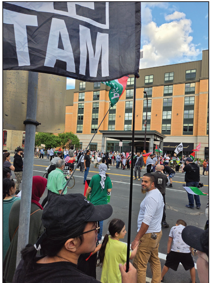
Protesting the visit of Former Israeli Prime Minister Neftali Bennet who came to Minneapolis on June 6 to be the keynote speaker at the American Experiment's annual gala dinner and fundraiser.