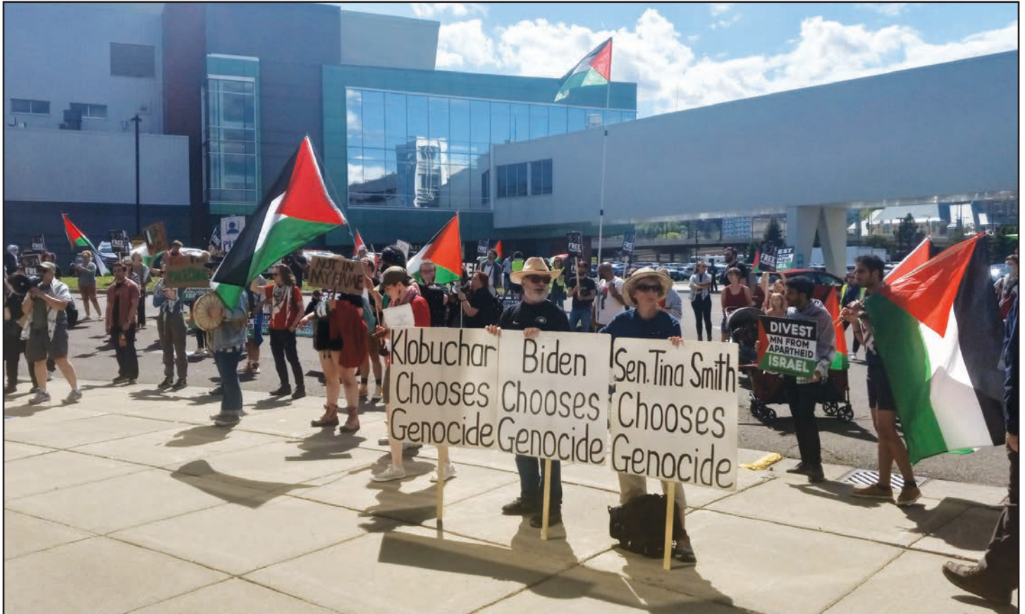
VFP and other activists recently attended the DFL State Convention in Duluth: May 31 - June 2